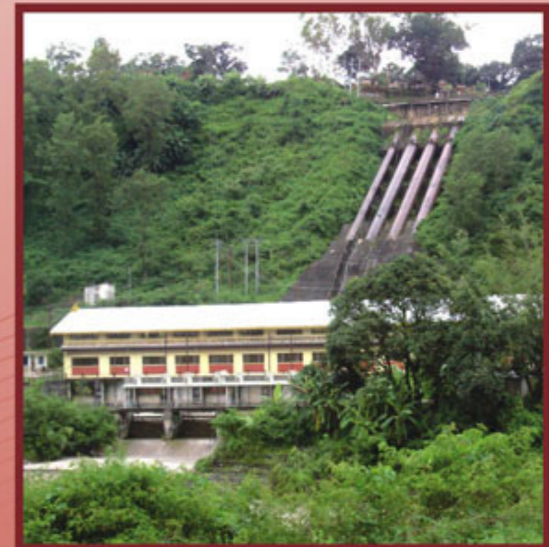
Trishuli Hydropower Plant