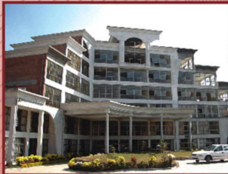
Kathmandu University, Balkumari Complex